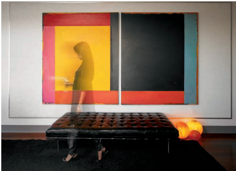
A Barcelona chaise and a floor light made from hand-blown Venini glass balls accent the grass-cloth panel, a backdrop for original art by Weinberg and Steve Litvak.

The entire living room design is a play on straight and curved lines. One of the more eye-catching elements is the natural West African driftwood that sits along the wall of windows. Its upwardly curving shape is a perfect example of how linear and contoured work together. A Horizon Home glass helix side table is a similar visual treat. Stacked blocks of glass wrap into a helix to form a base for the oval table.