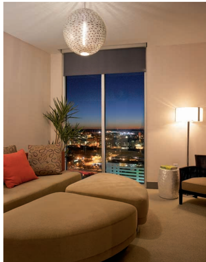
The walls of the media room are upholstered in soundproof acoustic material, so movie-theater volume levels won't disturb the rest of the building. Cleverly designed seating from Arte2 provides an array of seating options and converts into a bed for overnight guests.