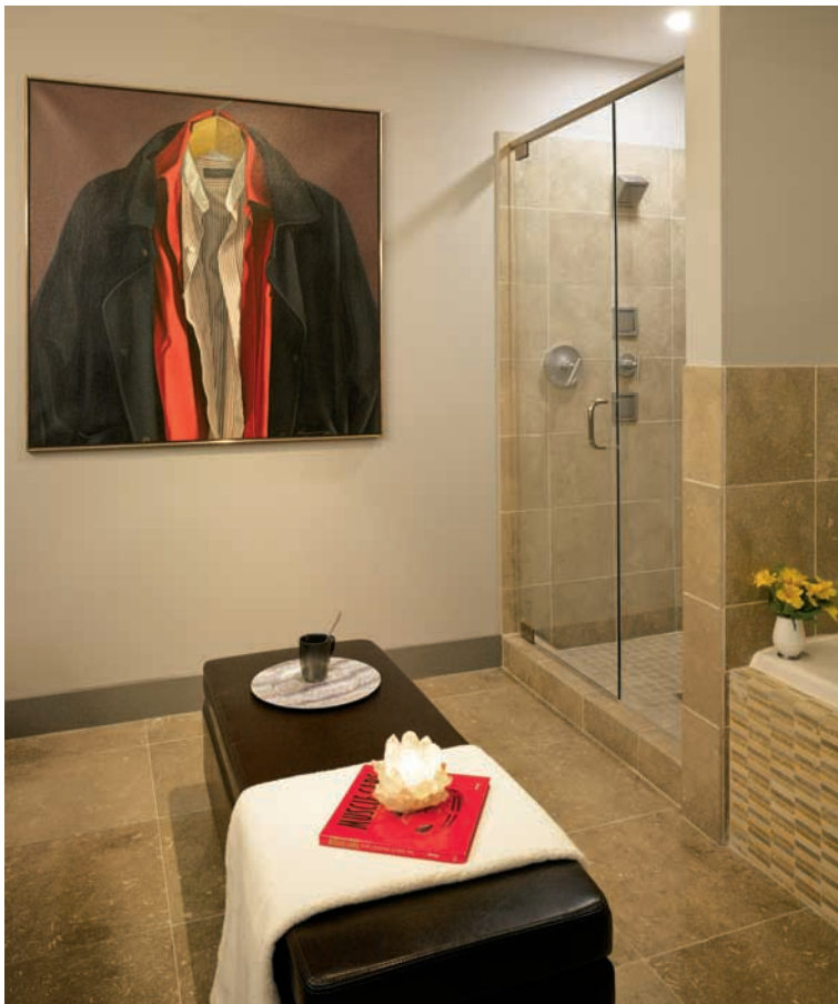
Earthy tile and stainless steel accents make up much of the bathroom , which includes triple Kohler water heads in the shower. Art by Alberto Magnani completes the area.