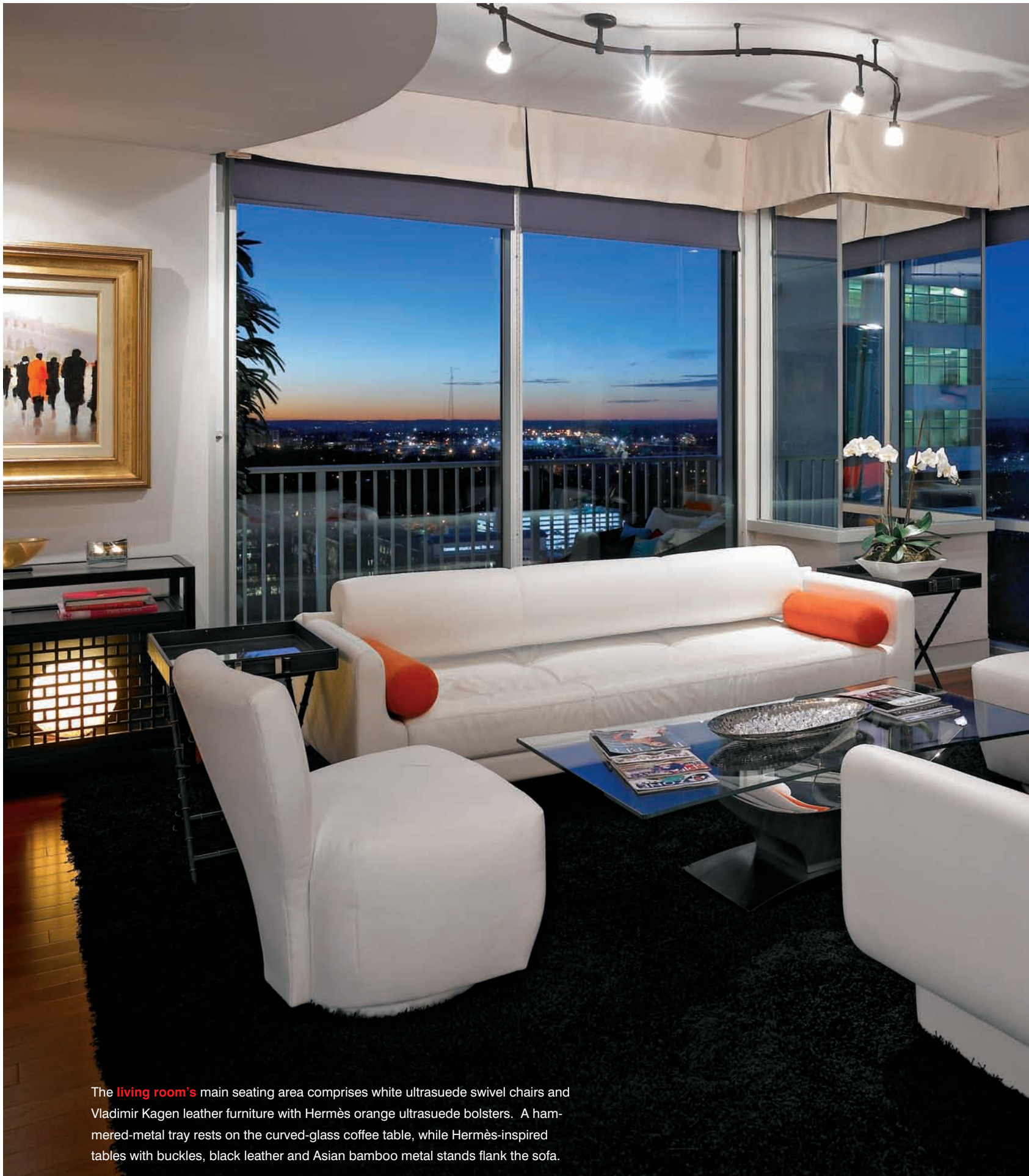
The living room's main seating area comprises white ultrasuede swivel chairs and Vladimir Kagen leather furniture with Hermès orange ultrasuede bolsters. A hammered-metal tray rests on the curved-glass coffee table, while Hermès-inspired tables with buckles, black leather and Asian bamboo metal stands flank the sofa.