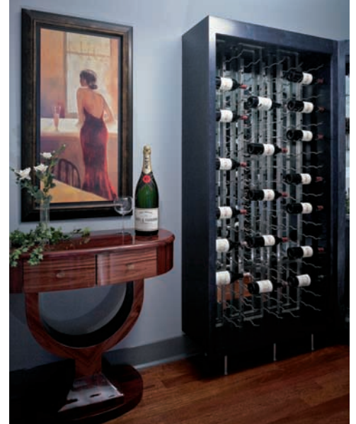
A modern take on a wine cellar includes a bottle rack from CellarMaker and a mahogany table with a beautiful wood grain from Horizon Home.